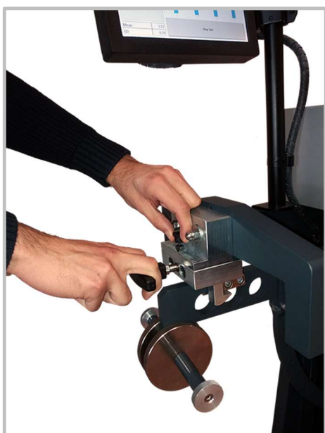
Security pendulum release system