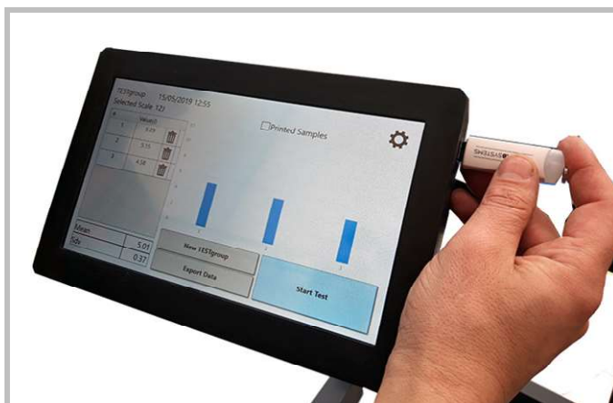
USB port data output to USB memory